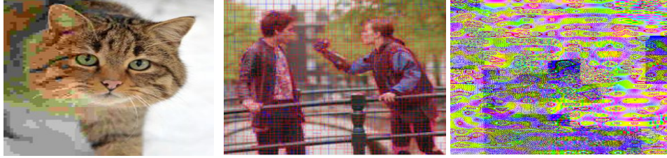
Figure 2: Examples of visual corruptions